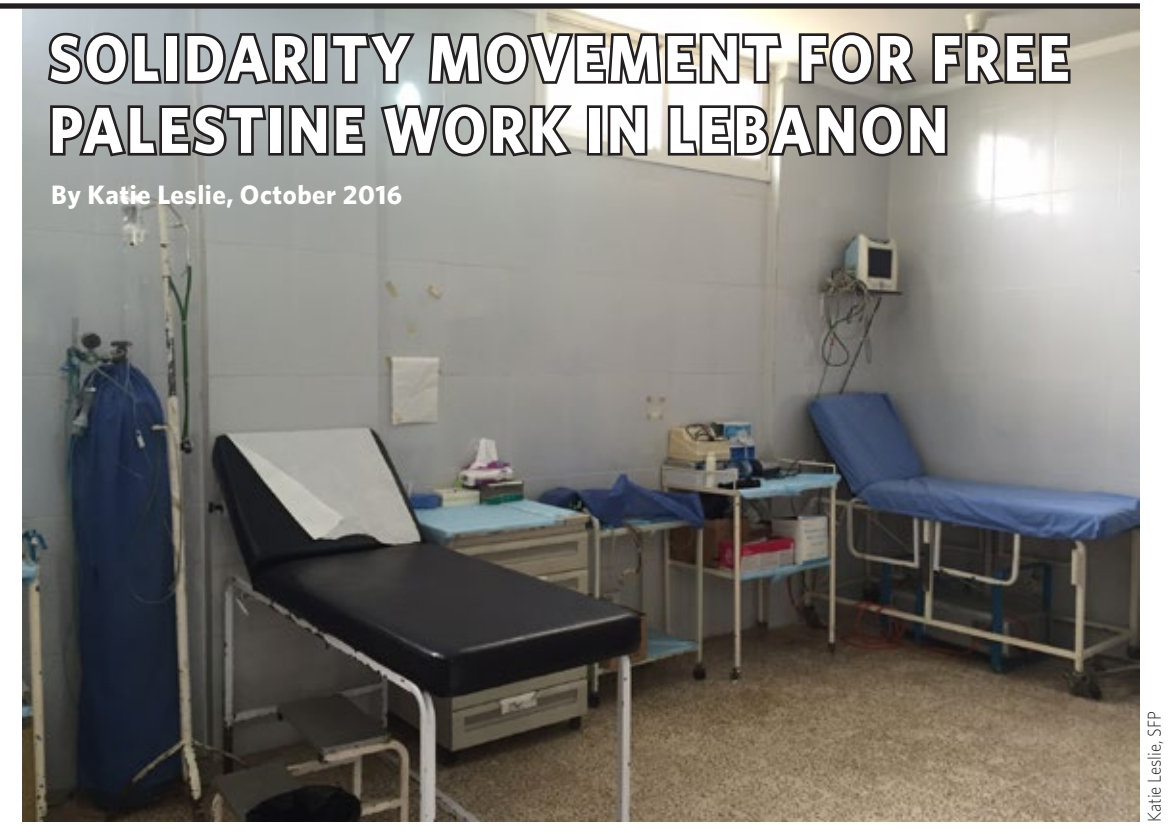
The Nahr al-Bared maternity hospital.